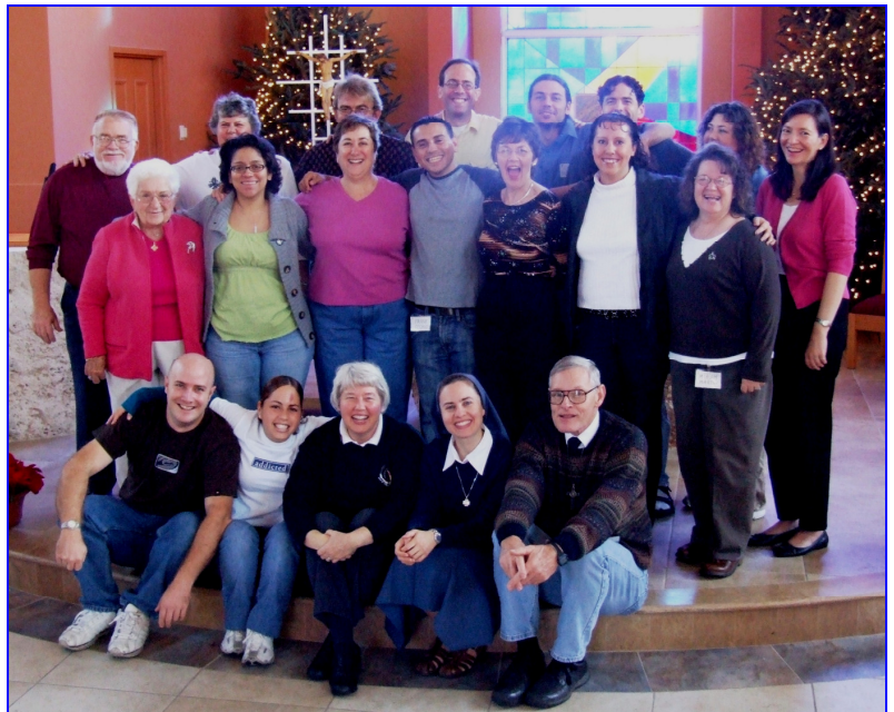
Miami Sunshine TEC hosted the latest Renewing the Vision workshop at St. Thomas University in Miami, Fla., Dec. 8-10.